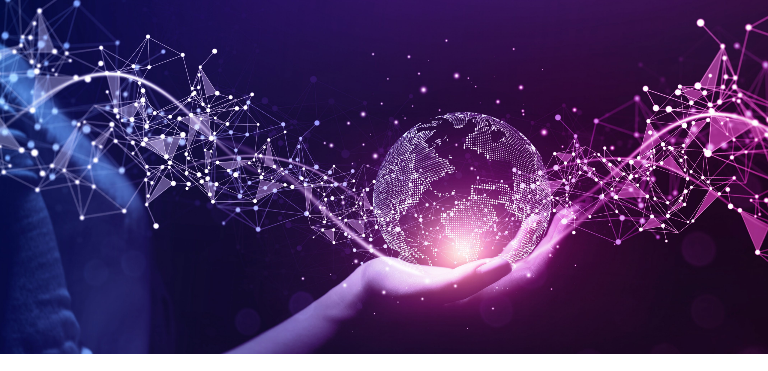
CERTIFICATE IN LAW AND REGULATION OF INCLUSIVE FINANCE